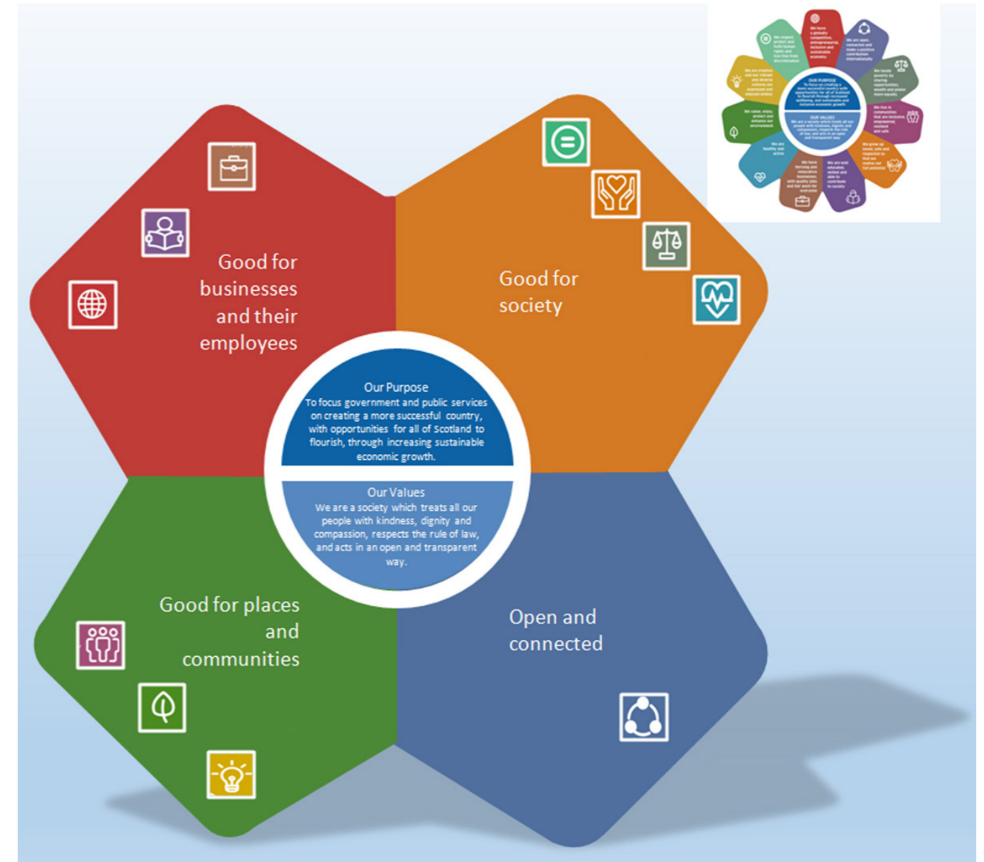
Figure 3 Priorities for Scottish Public Procurement

We will ensure that we work within the national context under the Scottish Government Priorities for Scottish Public Procurement, which aligns with the National Performance framework